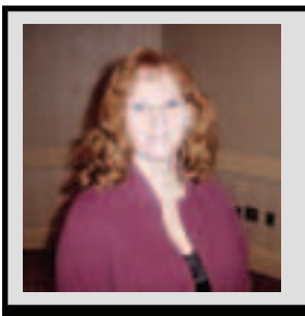
Area 9 Report