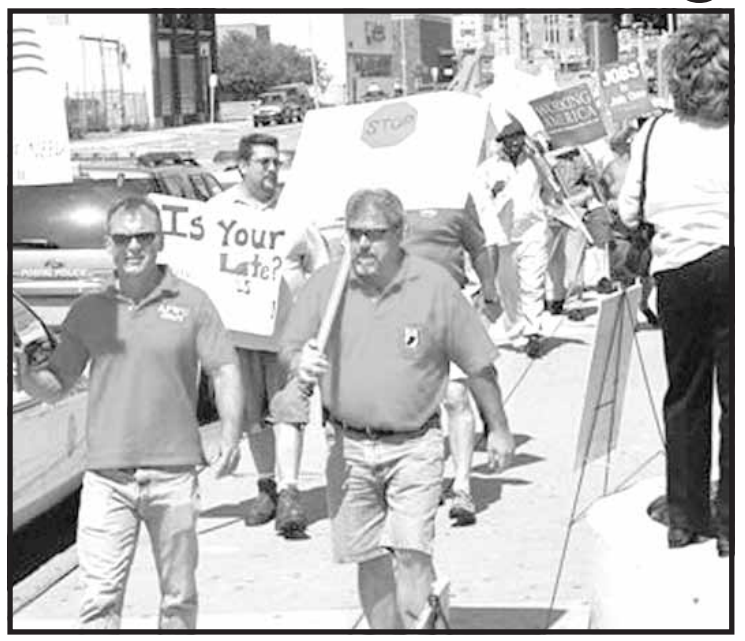
Bloomfield Picket.