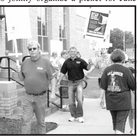
Iron Mountain Picket.

city employees, and county employees were also included. On June 12 we held a strategy summit, and during the breakout session, the postal workers' breakout, consisting of reps from APWU, NALC and NPMHU, decided to jointly organize a picket for June