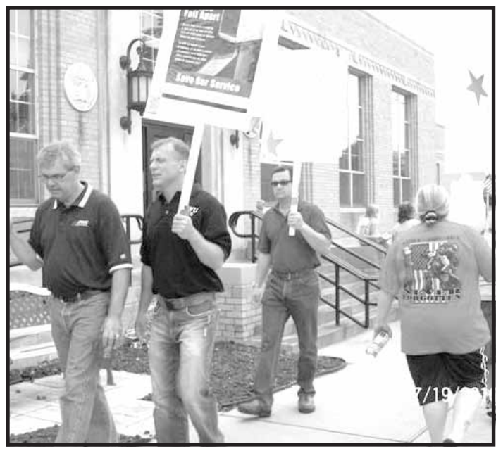
Iron Mountain Picket.