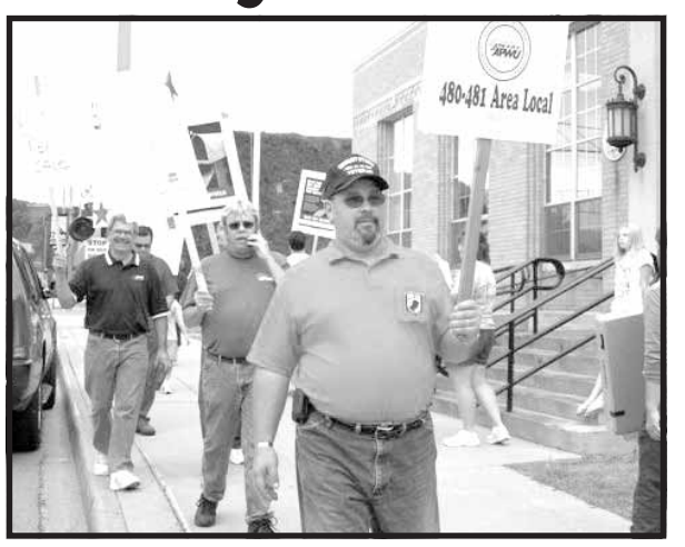
Iron Mountain Picket.