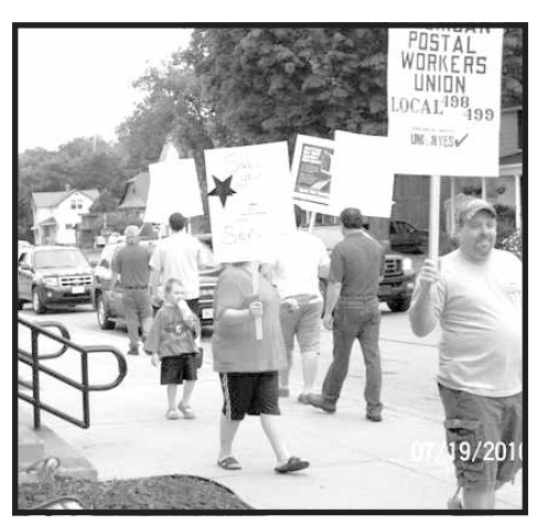
Iron Mountain Picket.

It was my pleasure for the MPWU to be included in the informational pickets at the Bloomfield Hills post office and the Fort Street Facility in Detroit. We must stand up to defend our jobs and the public from an overreaching postal bureaucracy that has forgotten who we really work for. For you EAS that may be reading this article we work for the American people not the mailing industry. I commend the DDAL and the 480-481 Area locals for a well run and professional events. On that note the Traverse City Area and 480-481 Area locals are sending support along with the MPWU to Iron Mountain in defense of