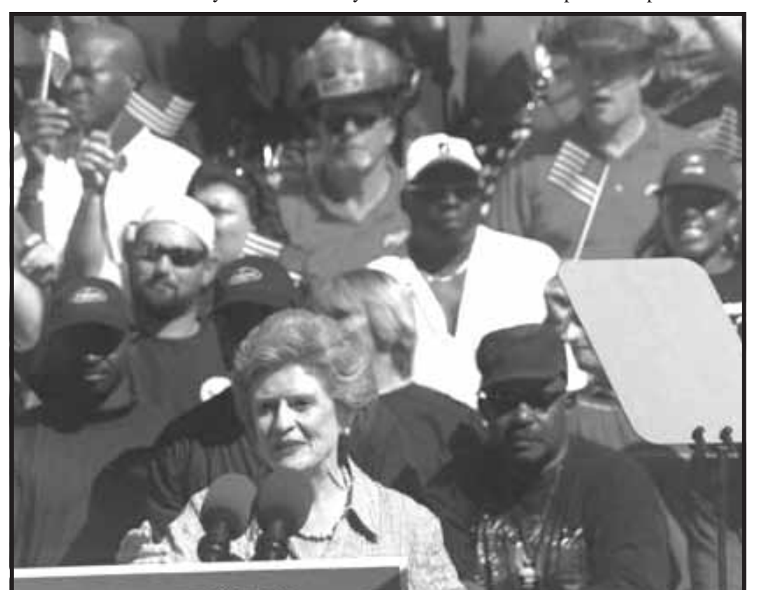
Senator Debbie Stabenow expressing support for the labor movement in Detroit on Labor Day.

For my part, I have no problem characterizing these corporate-centric super-PACs as treasonous. They are designed to subvert American democracy and turn our country over to the moneyed aristocracy. Their aspirations are apostasy to the notion of democratic governance that our Founders intended. We are now in a free fall toward oldfashioned oligarchy - that noxious, thieving, tyrannical, oppressive species of government that America's original settlers fled Europe to escape . . .