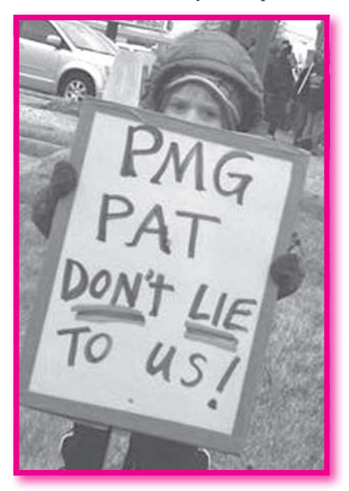
A message for the PMG.

So give a call with any questions or concerns and I will try to help.