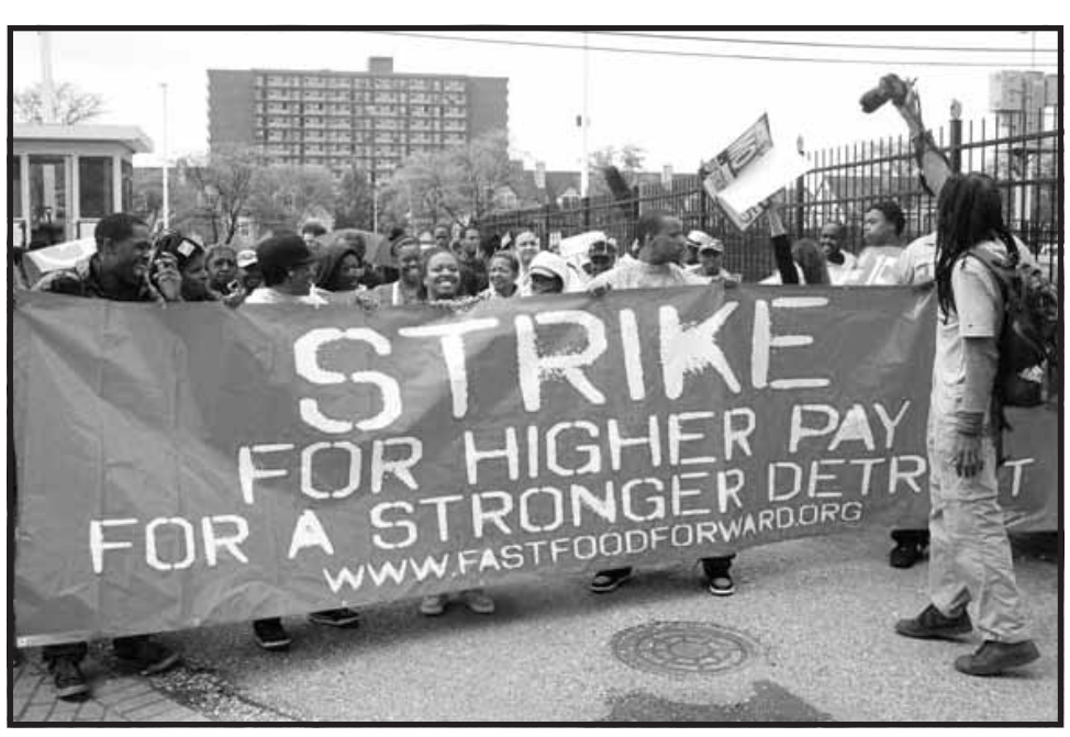
Fast Food Workers rally in Detroit.

The APWU did not mobilize energetically around the six vs. five day issue - though we did support the NALC