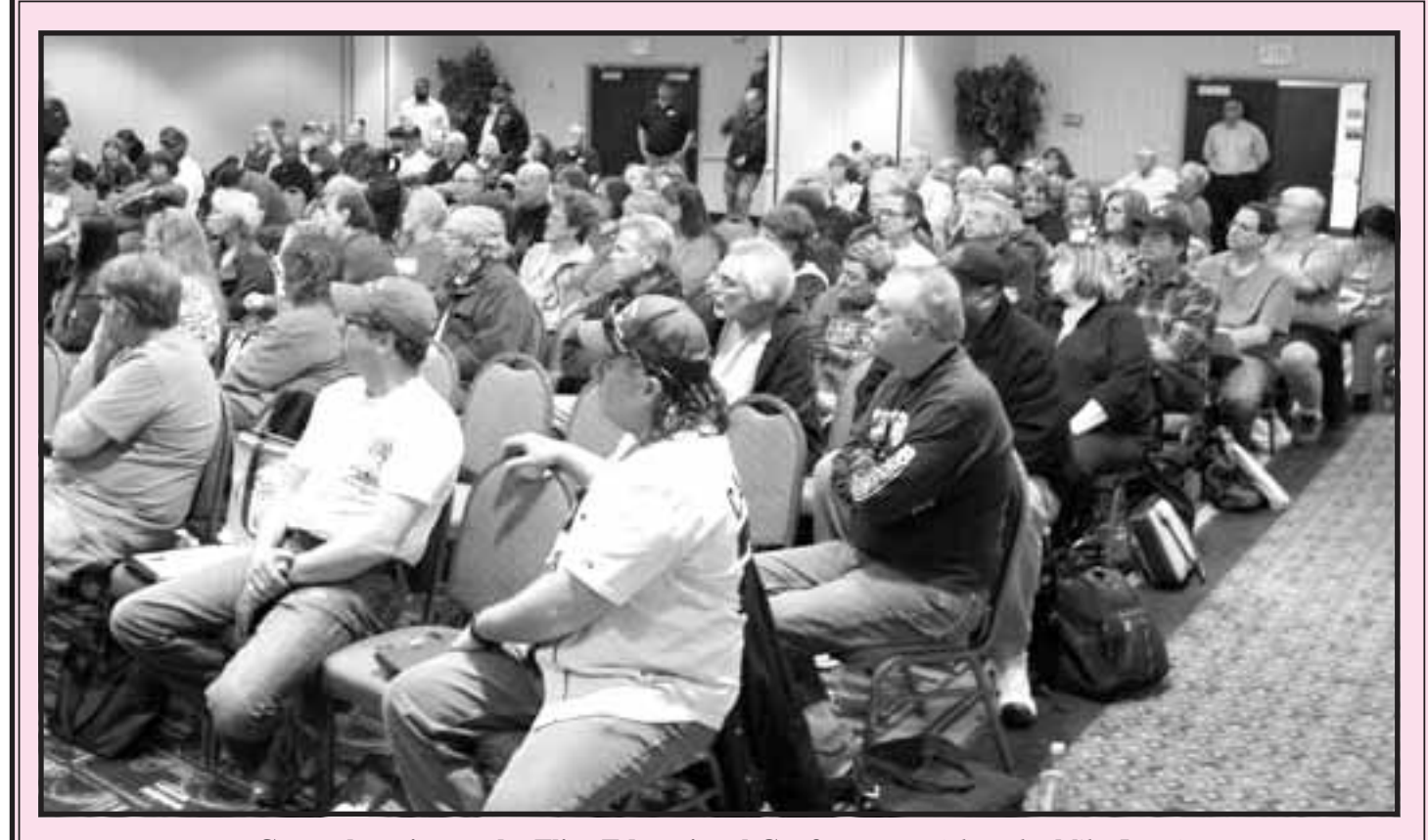
General session at the Flint Educational Conference.

"In the end, aggressors always destroy themselves, making way for others who know how to cooperate and get along. Life is much less a competitive struggle for survival than a triumph of cooperation and creativity." -Capri