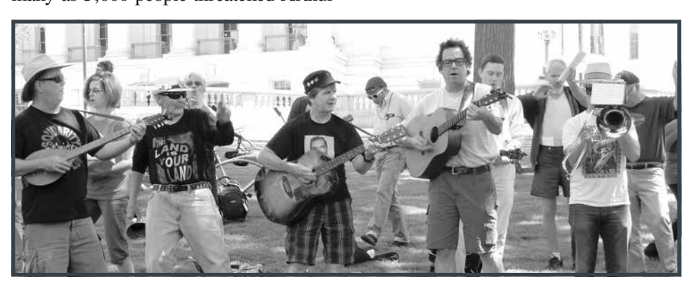
The Solidarity Sing-along protest at the State Capitol was a highlight of the PPA Conference.

is that a number of states passed progressive ballot initiatives, such as raising the minimum wage, while electing right wing candidates whose views are the exact opposite. The American people are more progressive than we think, though you couldn't always tell it from the corporate media. The 2016 elections are going to be very important to postal workers.