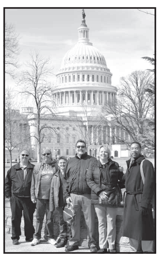
Michigan State President and Local Presidents and Officers.

leadership of Chaffetz and Cummings we see perfect language get passed?