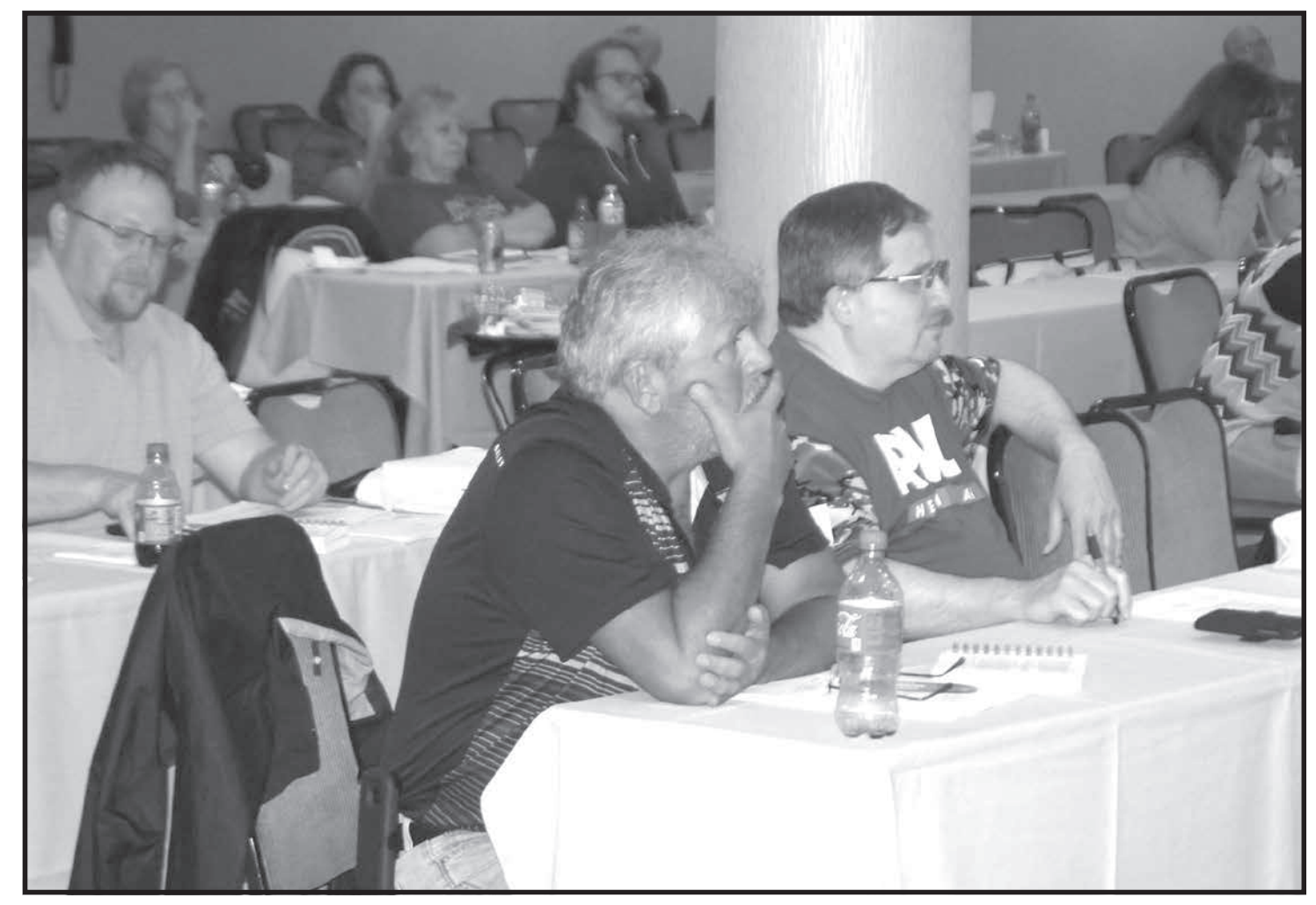
MPWU members attending the Educational Conference.