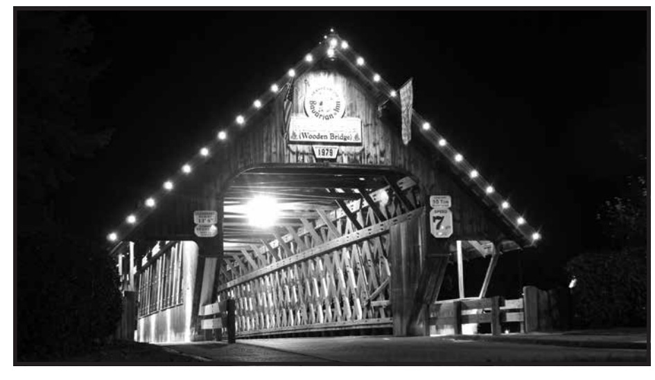
The Bridge leading to the Bavarian Inn where the Area 4,5 & 6 Conference was held.