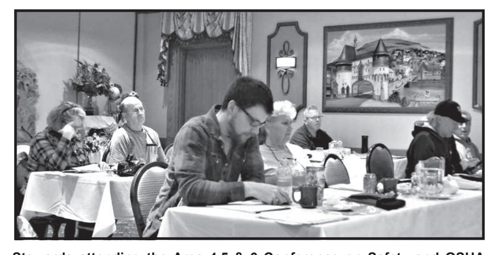
Stewards attending the Area 4,5 & 6 Conference on Safety and OSHA Training.

The Michigan Postal Workers Union proudly represents the Members at Large within the Great State of Michigan. The following locals have also affiliated with the MPWU for training, education and information sharing between their members, stewards and officers of their own local and others throughout the state and nation: