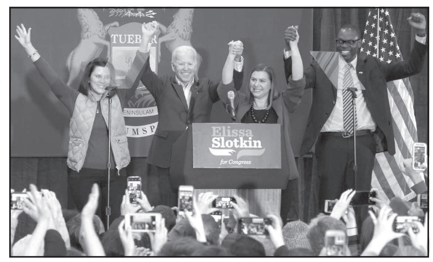
Governor Elect Gretchen Whitmer, Vice President Joe Biden, Elissa Slotkin, the new U.S. Rep for Michigan District 8 and Lt. Governor Elect Garlin Gilchrist II.

news coverage, good or bad. Trump and the republican party have gotten a daily dose of it for the last two years, but the Democrats haven't. It appears we are a one party system to the main stream news media.